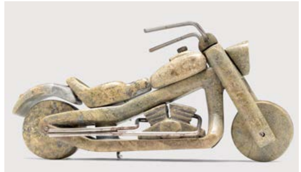
Ricky Jaw Chopper Motorcycle (2018)

*WHEN BOOKING, AD MATERIAL WILL NEED TO BE SUPPLIED IN MULTIPLE FORMATS TO ACCOMMODATE MOBILE APPLICATIONS